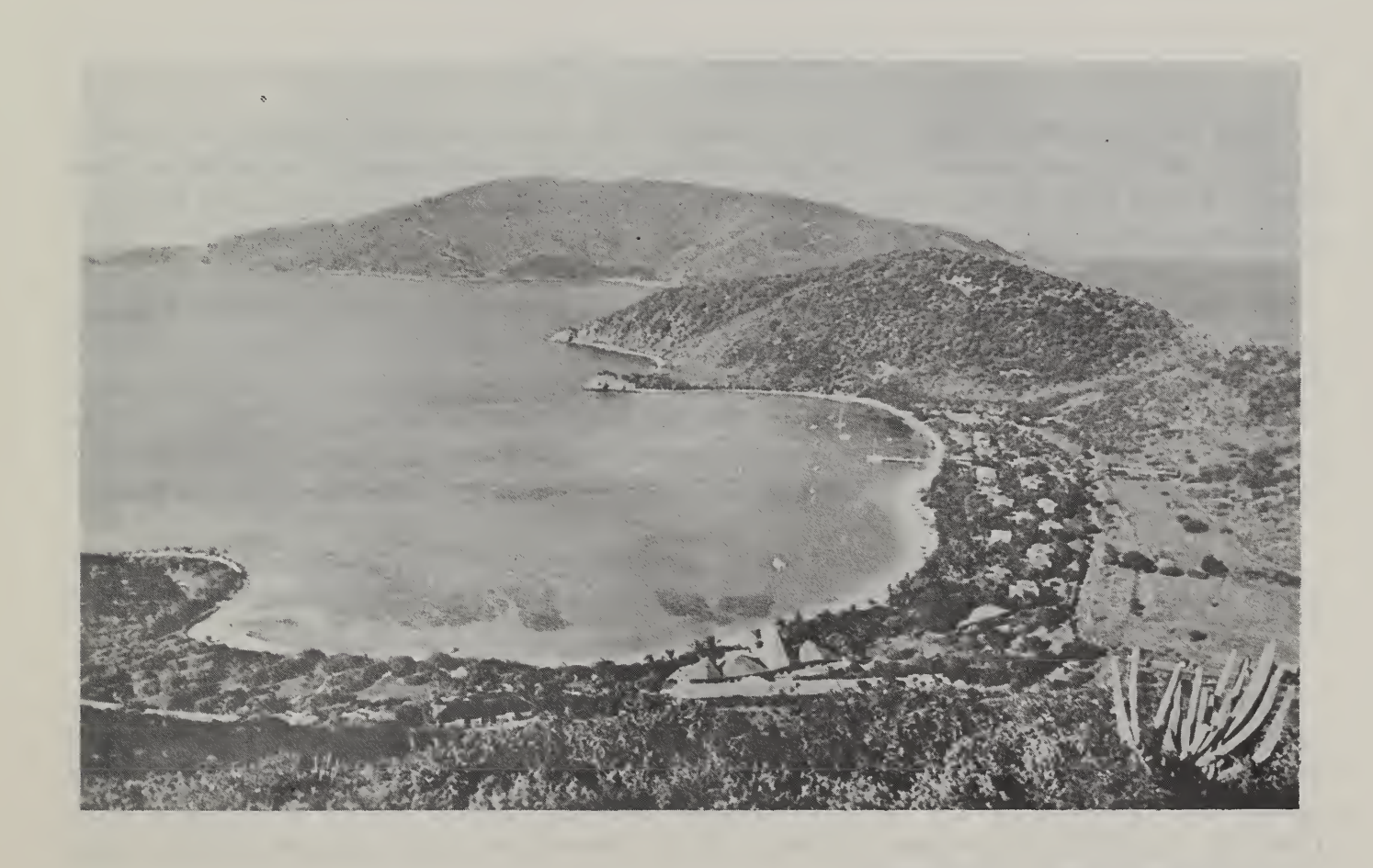
Figure 3. - Virgin Gorda, looking northeast. Little Dix Bay resort in foreground, Gorda Peak in distance.

As noted earlier, Clusia rosea is a characteristic species on the granitoid boulders at the southwest end of Virgin Gorda. Other tree species here are Coccoloba unifera and Chrysobalanus icaco . Near the beach in the Boulder Area are these shrubs and herbs: Caesalpinia crista ,